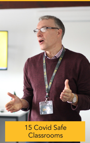
15 Covid Safe Classrooms

Find out more about Learning with ELI Schools