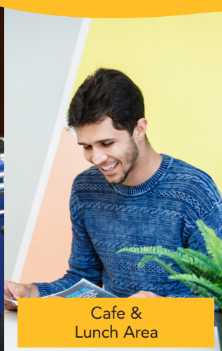
Cafe & Lunch Area