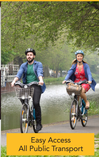
Easy Access All Public Transport