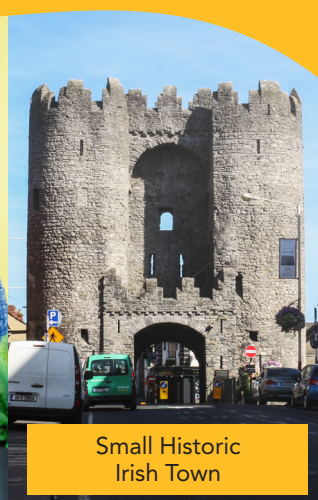
Small Historic Irish Town